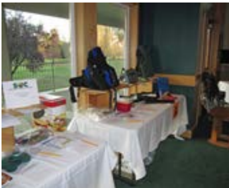
Two of the Seven Silent Auction Tables at the last Auction

club is once again conducting a fund-raising auction in November of this year. To make bidding attractive, we will need items that will appeal to the broadest interests of the members. To that end, the board of directors are working diligently to provide the auction items that will ensure a successful effort, but we can't do it alone. In the past, we had a auction chair