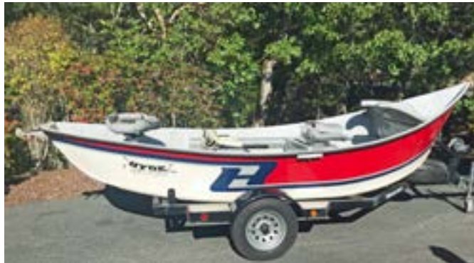
A few raffles ago we also raffled off this drift boat as part of our annual fund raising auction.